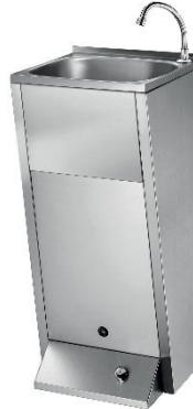
SNLMP60CS Satin finish