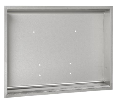
KT0016HCS Satin finish