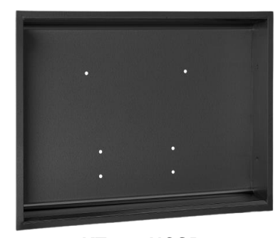
KT0016HCSB Matte black finish